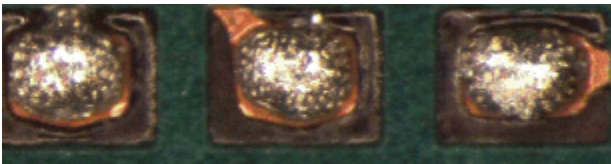
Figure 3: Partially coalesced solder on fine deposits appears as a grape-like cluster.